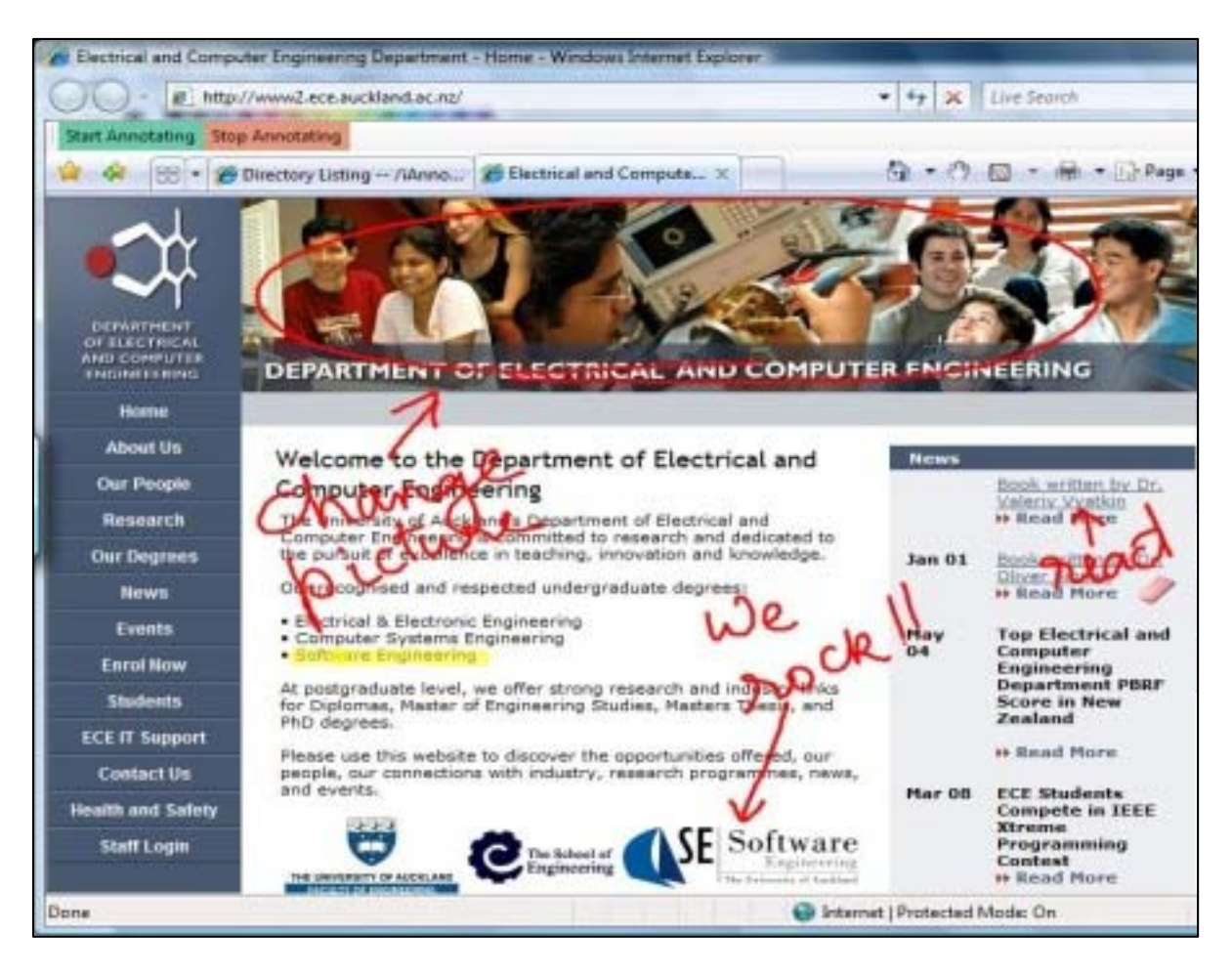
Figure 2: Prototype one

The second method uses a bounding box to group ink strokes into annotations. The bounding box implemented is similar to that used by Priest and Plimmer (2006).