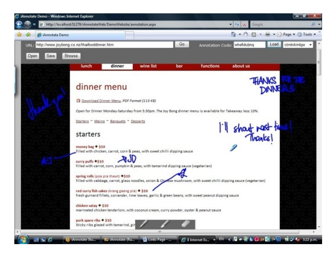
Figure 9: Multiple user's annotations of a web page

pre-prepared four annotations of an online menu site for this.